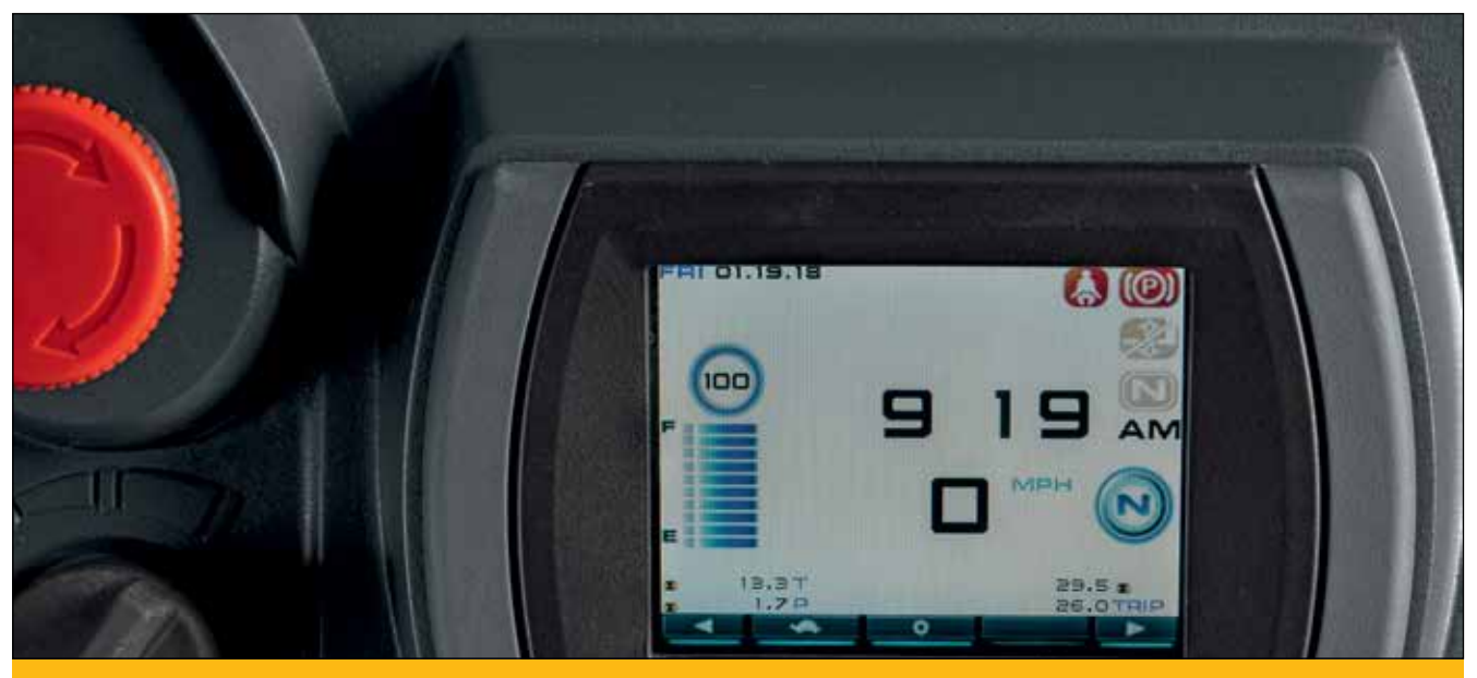
The display includes date, clock, speedometer, vehicle hour meter, warning icons and more.